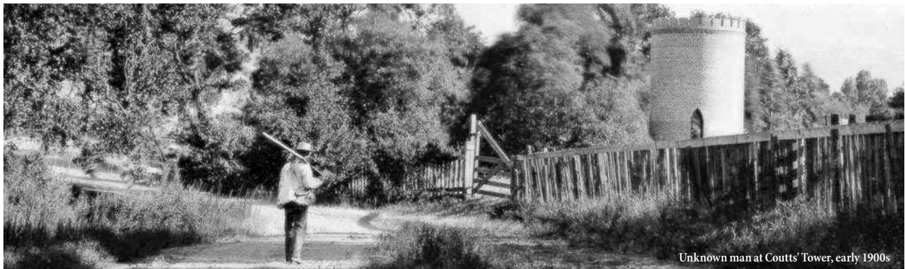
Unknown man at Coutts' Tower, early 1900s