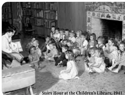
Story Hour at the Children's Library, 1941