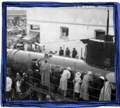
Captured Japanese submarine traveled the U.S. as a War Bond fundraiser. Displayed on Ramona Steet, 1942

Every aspect of life was dramatically altered during World War II. Neighbors banded together, fostering a strong sense of camaraderie and dedication to patriotic duty. Scarcity and shortages were the norm. Civilians supported the military effort by rationing essential items like food, recycling scrap, and buying war bonds.