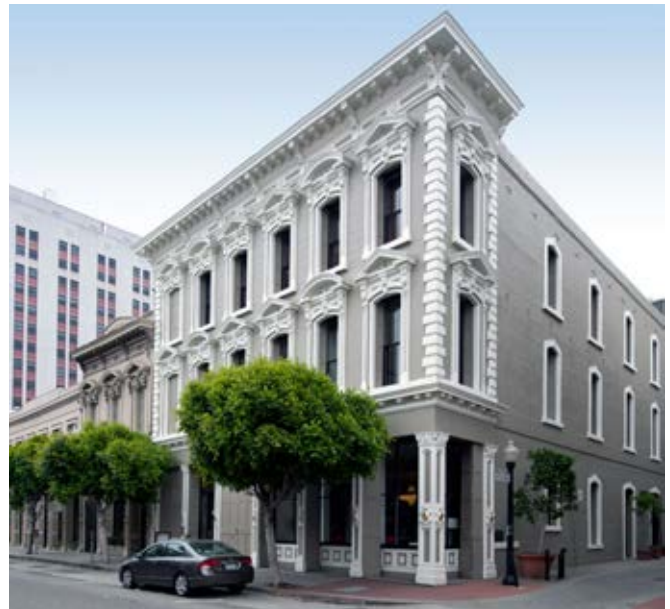
Restored Hotaling warehouse building in the Jackson Square Historical District of San Francisco

If, as they say, God spanked the town for being over frisky, Why did He burn the churches down and save Hotaling's whisky?