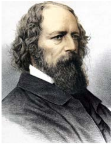
Tennyson Avenue is named after Alfred, Lord Tennyson

The street named for poet William Cowper was part of the 1889 University Park map, but the streets named for Rudyard Kipling, George Gordon Byron, and the 16th century Neapolitan poet Torquato Tasso were not. Rather, their names were used for midblock subdivision segments. Kipling was noted for: “If you can keep your head when all about you are losing theirs and blaming it on you.” Lord Byron wrote, “Love will find a way through paths where wolves fear to prey.”