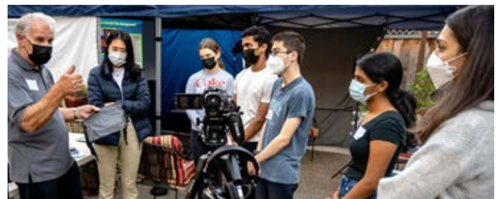
Video professionals and oral history experts work with the teens

The Teen Council’s newest project is an “Object Memory” project celebrating Palo Alto’s culturally diverse and dynamic community by collecting images of sentimental objects that symbolize a family’s cultural experiences. This project is designed to demonstrate that cultural diversity has helped to shape and enrich the Palo Alto community.