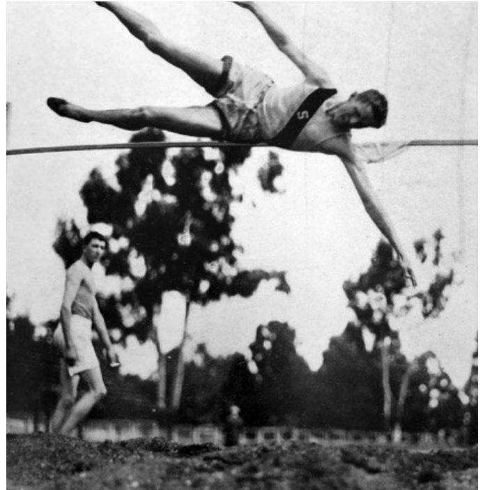
George Horine setting the high jump record at 6' 6 1/8", 1912

missing at 1.93 meters. Jim Thorpe, the famous Native American athlete, tied for fourth, and later won the pentathlon and decathlon.