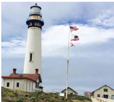
Pigeon Point Lighthouse

Six miles south of the intersection of Highway 1 with Pescadero Creek Road, is the Pigeon Point Lighthouse . The white-plastered masonry tower is 115 feet tall and is tied with the Point Arena Lighthouse for the tallest lighthouse on the U.S. west coast.