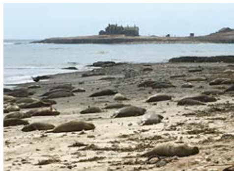
Elephant seals at Año Nuevo State Reserve, Año Nuevo Island in the distance

For more information, call (650) 879-2120 or visit: https://www.parks.ca.gov/?page_id=533 . The park is open 8am to sunset. The Visitor Center and Park Store are open Thursdays-Mondays, 10am-4pm.