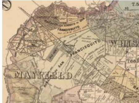
Map of the Palo Alto area in 1890

When Mexico took control of California in 1821, it began issuing land grants to both native-born and naturalized Mexican citizens to encourage settlement in the area. The grants were usually one to two square leagues in size (a league is approximately 4440 acres) and were called Ranchos. Present-day Palo Alto was part of two Ranchos. Rancho Rinconada del Arroyo de San Francisquito was a 2230-acre rancho granted to the Soto family. It encompassed the north end of Palo Alto and Menlo Park. Rancho Rincon de San Francisquito was an 8418-acre rancho granted to Jose Pena, and included present day south Palo Alto, future town of Mayfield, part of Stanford, as well as northern Mountain View.