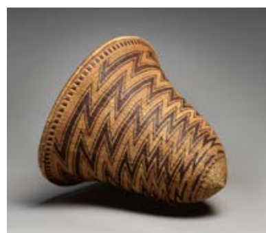
Pomo carrying basket