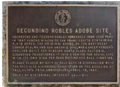
Plaque at intersection of Ferne Avenue and Alma Street