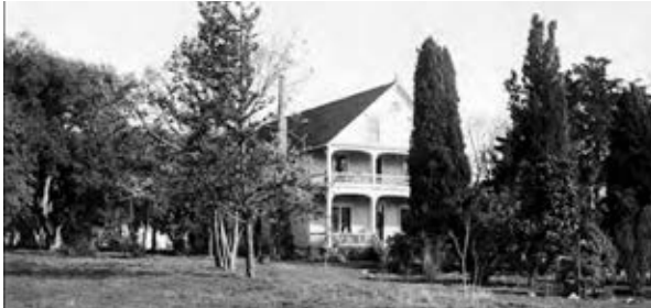
Greer home, built prior to 1890, today the site of Town & Country Village Shopping Center