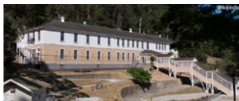
Reconstructed detention center at Angel Island Immigration Station

Take the opportunity to visit the Angel Island Immigration Museum , recently re-opened after 12-years of renovation and modernization. Its exhibits describe and present “both the dark and bright stories” of immigrants “who passed through it in the early 20th century”. Divided into 3 sections, the narrative is enhanced with powerful artifacts, documents, and commentaries. The Museum, located in the station’s former hospital, is free and open to the public weekends from 11:00am to 3:30pm. Docent tours are also available. For information on the ferry schedule to and from Angel Island, as well as details about the museum, call 415-435-3522 or visit the website www.aiisf.org/visit