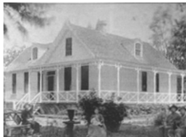
Newell Residence, 1886.