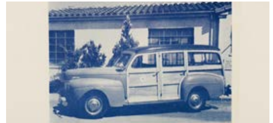
The Palo Alto Animal Shelter's brand spankin' new 1942 animal rescue vehicle

After 13 years of on again/off again negotiations between the City and the Humane Society, a state-of-the-art shelter opened in 1937 that earned for Palo Alto both state and national recognition for excellence in the care of wayward animals, domestic and wild.