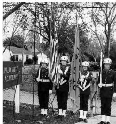
Palo Alto Military Academy Cadets