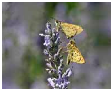
Fiery Skippers

If you missed the Palo Alto Garden Club and Gamble Garden celebration of Monarch butterflies earlier this month, it's not too late to take a "Butterfly Walk." Bring your binoculars and join docents on a tour through UC Berkeley's Botanical Gardens , 200 Centennial Drive. Tours scheduled for Tuesday, October 22, 1:30-2:30 pm or 3:00-4:00 pm. For more information including registration and cost, visit https://botanicalgarden.berkeley.edu/ .