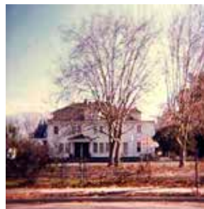
Palo Alto Military Academy Manzanita Hall, 1972

As you can imagine, there were a lot of dishes! The extra ones were stored in a shed at our house. When our church needed housewares to support new immigrant families, my family gave out sets of Palo Alto Military Academy dishes.