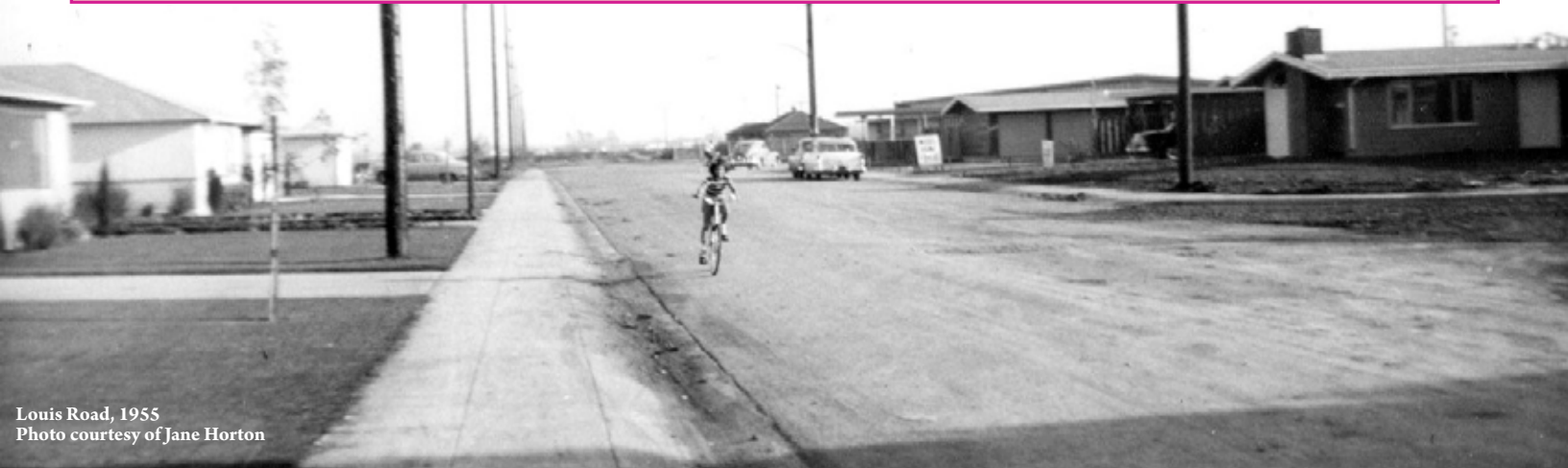
Louis Road, 1955

Sunday, November 3, 2019 2:00 – 4:00 pm Palo Alto Art Center – 1313 Newell Road, Palo Alto