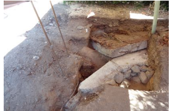
Discoveries from a recent dig on Stanford property off Old Page Mill Road.