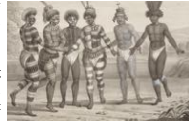
Six Ohlone dancers at Mission San Jose.

with Ohlone people from missions and other sources during the Spanish settlement period. The Spanish missions were established ca. 1770. The missions had a disastrous effect on the foraging (hunting-gathering) customs of the Ohlone as did their efforts to impose their Christian culture on native peoples; as well, disease took a heavy toll, essentially ending the Ohlone period at the end of the 18th century. Mexico ceded California, and its Ohlone inhabitants, to the United States in 1846 after the Mexican-American War. Some small enclaves of native populations remained until mid-19th century, and people who identify with the native populations remain today.