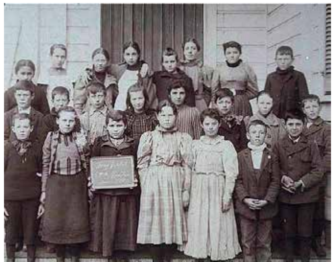
Sixth grade students pose for a class picture, taken in 1897, in front of the Mayfield School built in 1867.