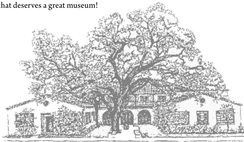
Illustration of the Roth Building, future home of the Palo Alto History Museum, on the corner of Bryant and Homer

to remind us of the innovation and creativity that are virtual synonyms of Palo Alto—a city that deserves a great museum!