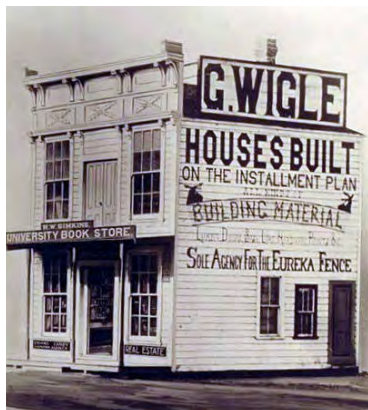
Simkins University Bookstore, 1892

Listed below are community businesses supporting our Palo Alto Historical Association by offering our publications. Consider using their services and products whenever possible, and please thank them for supporting PAHA.