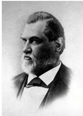
Governor Leland Stanford fought political battles to keep California in the Union.

For many Californians the Civil War has always been an historic event geographically removed, much like the Revolutionary War of the 1770s. Aside from a few skirmishes and the threat of Confederate raiders off the California coast, the Civil War did not “happen” in California. Yet Californians played a significant role in the conflict. When the South Carolinians fired upon Fort Sumter in April 1861, there was a real fear that California might join the Confederate States. Many of our politicians were originally from southern states and it was felt that their influence might push California to withdraw from the Union. But the newly elected Republican governor was born and raised in New York, and he fought the political battle to keep California in the Union. His name was Leland Stanford, and years later in an interview, he considered his role in keeping California in the Union to be one of his most significant accomplishments (along with building the railroad and his breeding and training trotting horses).