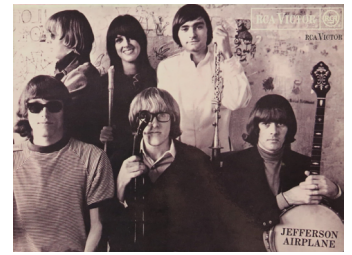
Surrealistic Pillow, 1967

Wednesday, June 5, 2019 6:00 – 9:00 pm El Palo Alto Room Mitchell Park Community Center 3700 Middlefield Road, Palo Alto