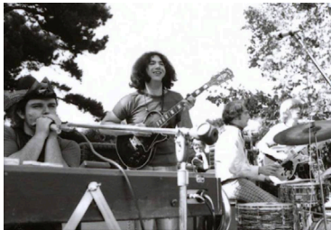
Grateful Dead, El Camino Park, 1967

Wednesday, June 5, 2019 6:00 – 9:00 pm El Palo Alto Room Mitchell Park Community Center 3700 Middlefield Road, Palo Alto